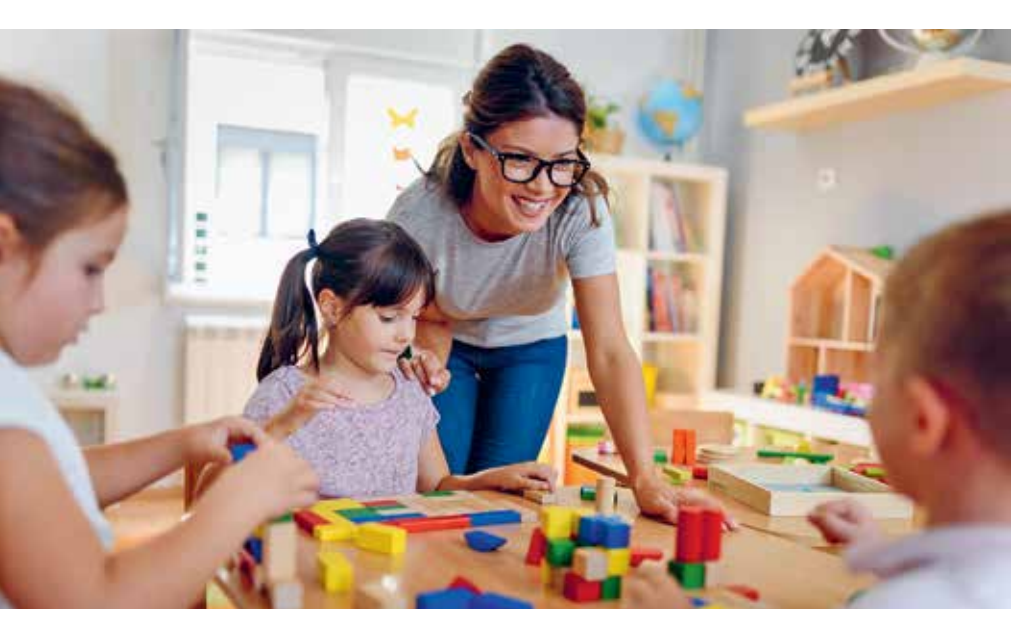
Switzerland's excellent education begins playfully in kindergarten.