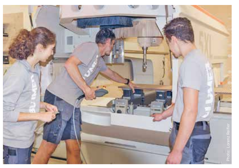
Dual vocational education and training is a Swiss success model.

After completing primary school, young people can attend the cantonal school or start one of around 250 different vocational apprenticeships. The latter are divided into a practical and a theoretical part, i.e. the young people receive basic training in a company on the one hand and attend a technical college on the other. This is known as the dual education system. After completing an apprenticeship of three or four years, the young professionals have the option of entering the workforce or continuing their education at a higher level. Switzerland's dual education system is exemplary and yields results: in no other European country is youth unemployment as low as in Switzerland.